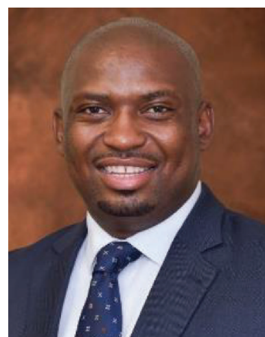
Deputy Minister of Higher Education and Training Mr Buti Manamela